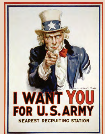
This image under public domain.

Vist the exhibit in Darling Library to learn about the global impact the Reformation has made. Click here to read more.